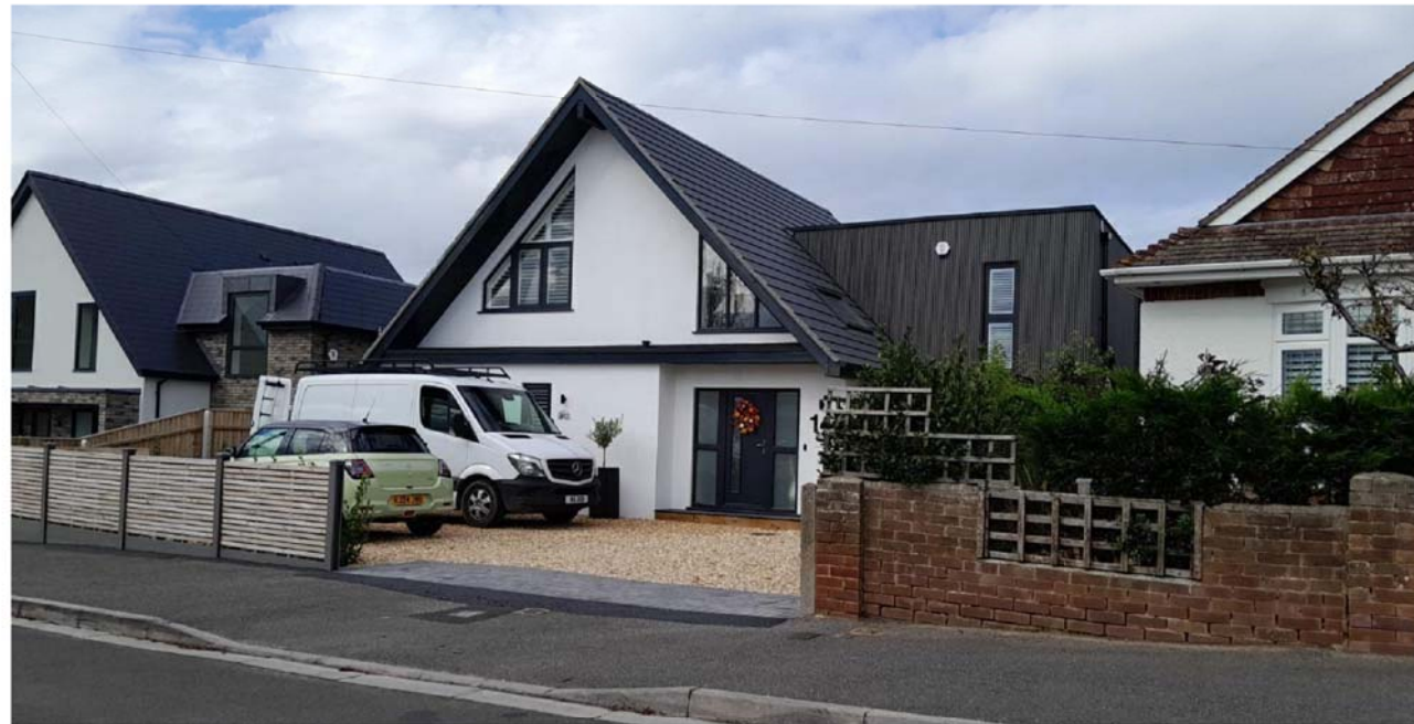
Nearby planning precedent: 14 Victoria Road - 8/21/0697/FUL - Flat roof side extension (Plans4home)