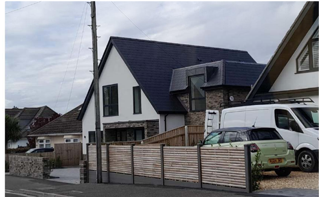
Nearby planning precedent: 12 Victoria Road - 8/23/0088/FUL - Mansard / flat roof side extension (Dot Architecture Ltd)